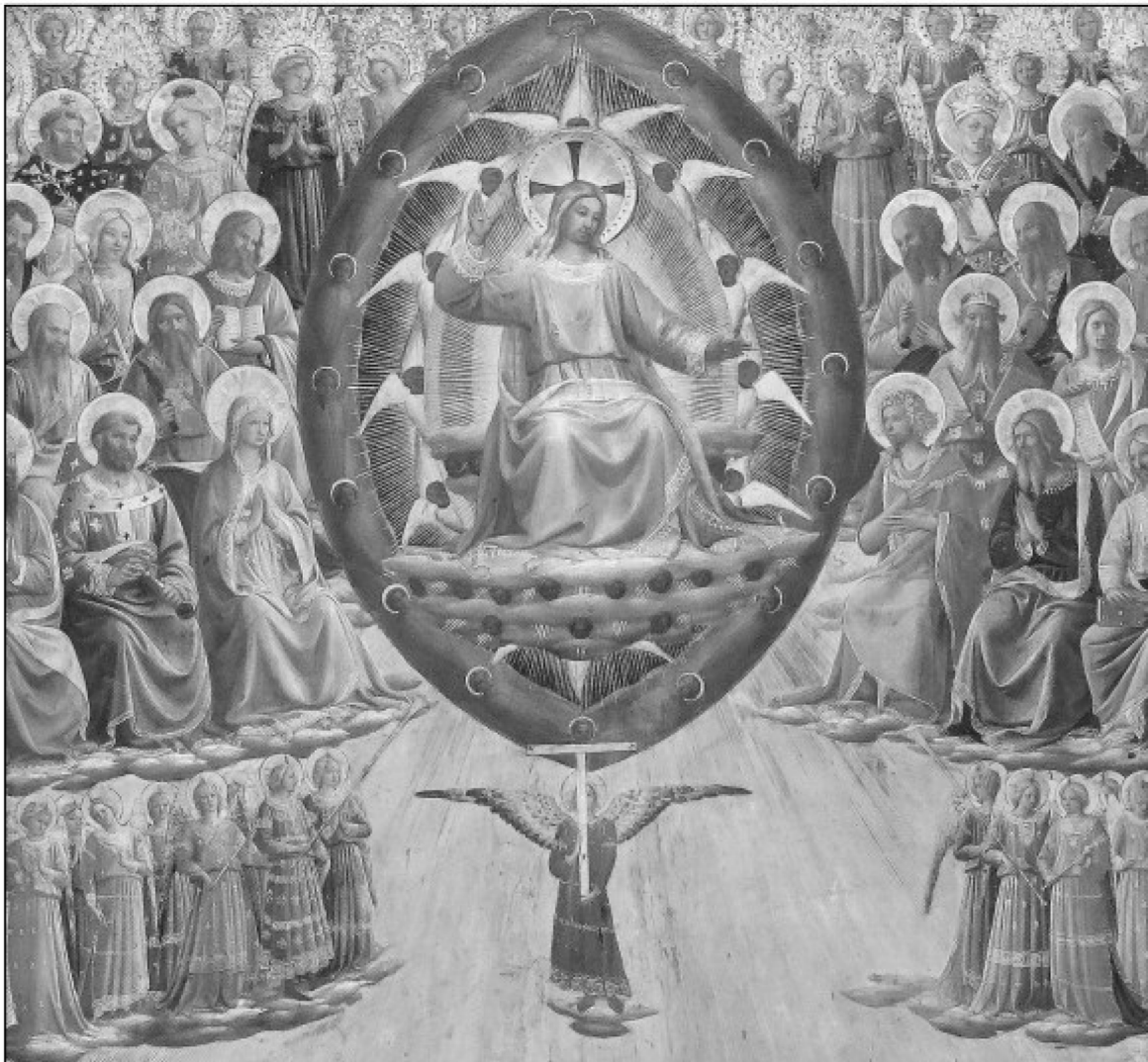
Christ and All Saints in Heaven, Fra Angelico (c. 1395–1455). Detail from Triptych: The Last Judgment [1435–1440] Public domain.

As [the disciples] were watching, [Jesus] was lifted up, and a cloud took him out of their sight. While he was going and they were gazing up toward heaven, suddenly two men in white robes stood by them. They said, "Men of Galilee, why do you stand looking up toward heaven? This Jesus, who has been taken up from you into heaven, will come in the same way as you saw him go into heaven."