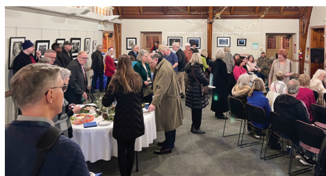
Photos from the Arts On The Square Gallery opening on January 18: Faces and Places