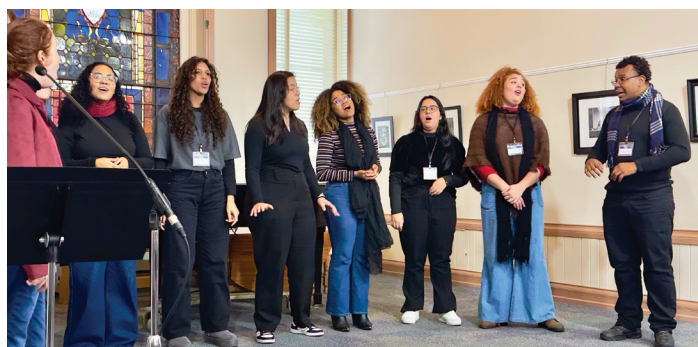
LVC exchange students from Brazil performed at the reception.