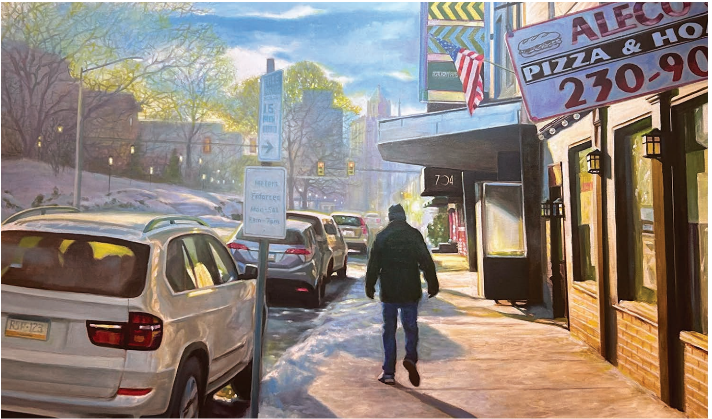
Clockwise, beginning with painting far left, page 10: