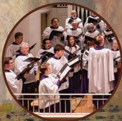
The Sanctuary Choir

Suggested donation $15 Complimentary parking in the adjacent Market Square Garage